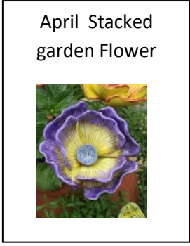
These are examples of the clay projects